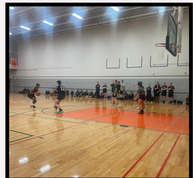
The final game in action