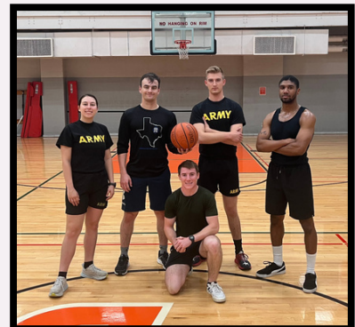
Team Dunkin’ Donuts wins the game!