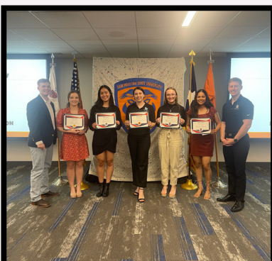
Top Female ACFT Awardees