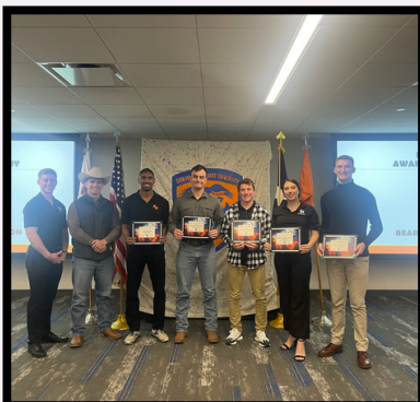
Team Dunkin’ Donuts