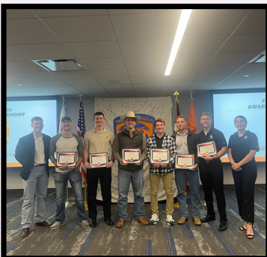
Top Male ACFT Awardees