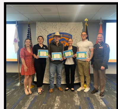
Best Mentor Awardees

Congratulations to the ROTC cadets for their exceptional dedication and hard work throughout the Fall 2023 semester. Their commitment to excellence and tireless efforts have undoubtedly contributed to the success of the program. It is with great pride that the Program recognizes Cadets for their unwavering determination and the values they embody as future leaders. Furthermore, congratulations to the winners of the Fall 2023 ROTC Awards Ceremony. Their outstanding achievements and noteworthy performances have set a standard for their peers. May this recognition serve as a testament to their leadership, discipline, and exemplary service. As they continue their journey into the Spring 2024 semester, know that their efforts are truly appreciated, and we look forward to witnessing the upcoming continued success and growth in the semesters to come. Well done, and congratulations once again!