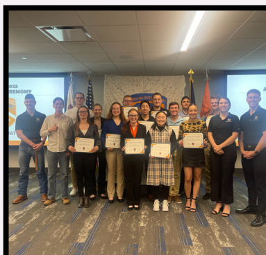
Push-Up Crew Awardees