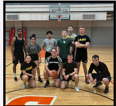
Both teams after the finals

The Cadet Intramural League (CIL) program was developed to build cohesion outside of normal ROTC activities and changes every semester based on the sports preferences of the Cadets. This year they selected basketball and after a semester long season and the playoffs concluded, we were left with two finalists – Dunkin’ Donuts and JumpTeam6. Competing in front of the whole battalion Dunkin’ Donuts came out on top as this semester’s CIL Champions. Congratulations to all the teams that participated and to the top two teams who received scholarships for their hard work and dedication! We look forward to seeing what the Cadets select for next semester and who will be crowned the champion!