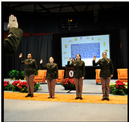
Newly Sworn-In Second Lieutenants