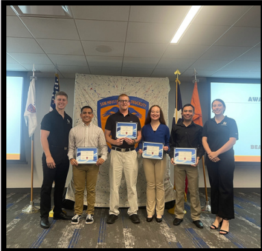
The Team Player Awardees